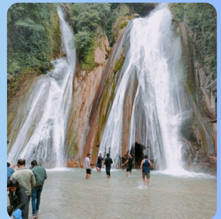
Kempty Falls of Mussoorie

Sangam of Alaknanda and Bhagirathi River at Devprayag