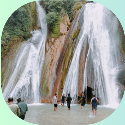
kempty falls mussoorie