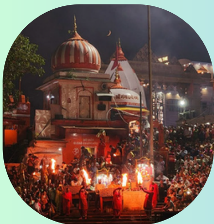
Mandakini River, Guptakashi