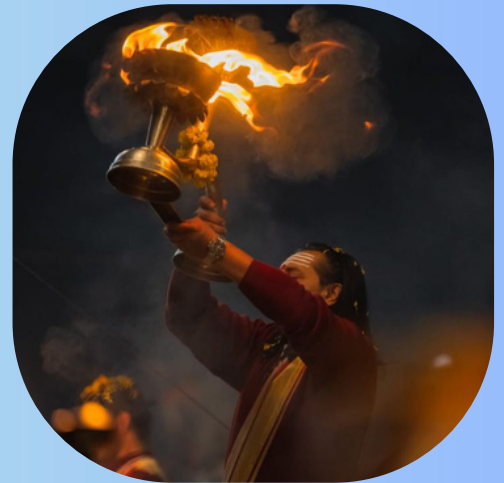
Ganga Aarti Haridwar