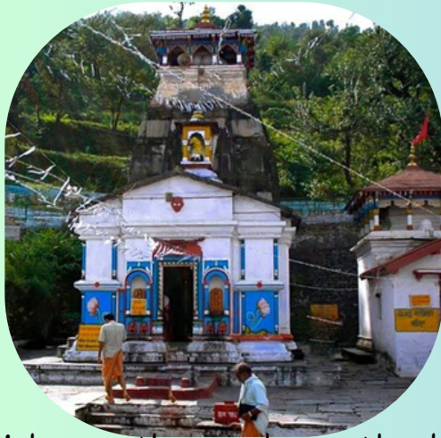
Vishwanath Temple Guptkashi