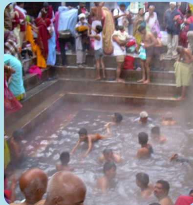
Tapt kund badrinath