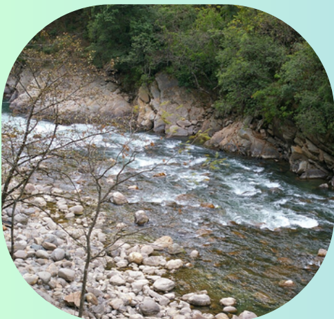
Mandakini River, Guptakashi