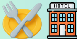
Dinner | Stay

Keep only essentials items (max 5 kgs) in a soft bag (duffel). Please keep your extra luggage at the hotels cloak room.