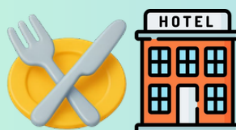
Breakfast | Lunch | Dinner | Stay

Early morning, take a flight for Harsil Helipad (Gangotri). Upon arrival, our team will pick you up and transfer you to Gangotri Temple with our VIP arrangements, enjoy a VIP darshan while skipping the waiting lines. After completing your darshan, check in to your hotel and spend the rest of the day relaxing and enjoying the fresh air of the valley.